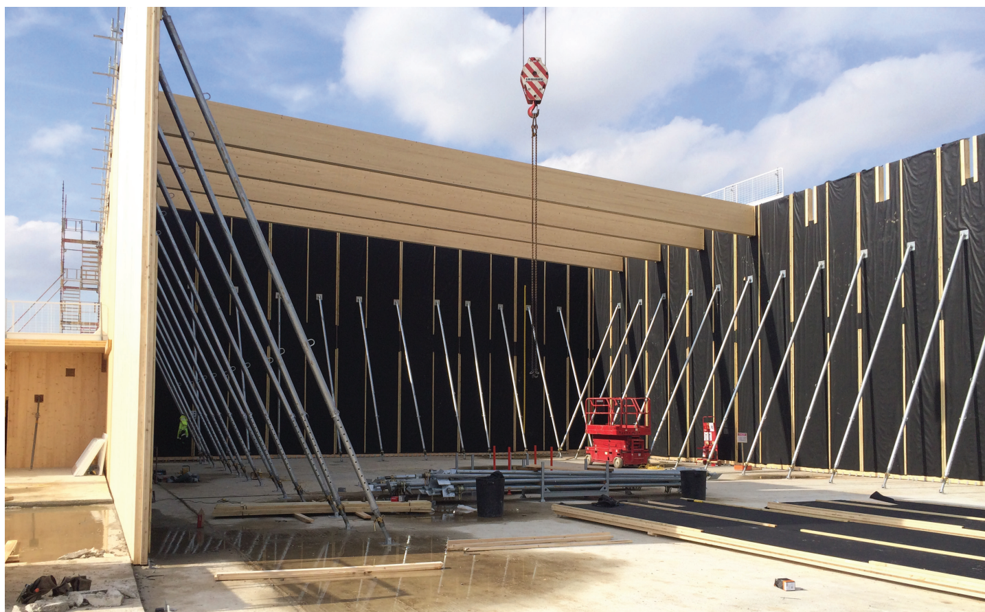
Fig 1 Temporary erection bracing and weather protection of CLT during erection

Any inspection reports and the STA checklists shall be available for third party warranty inspection.