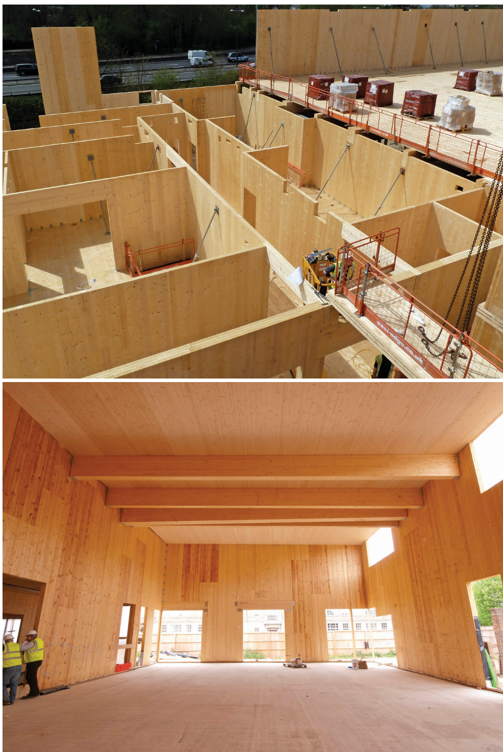
Fig 2 CLT panels during erection